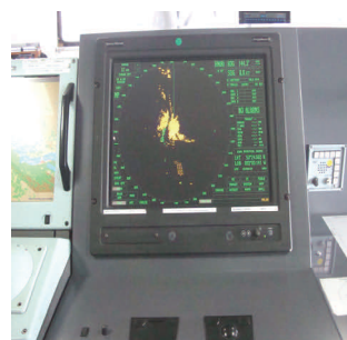
Keeping a good lookout !!!

From the bridge we went to the Captains accommodation, quite spacious quarters with day room, bedroom and an office reminiscent to that of a company board room having a single table and twelve chairs.