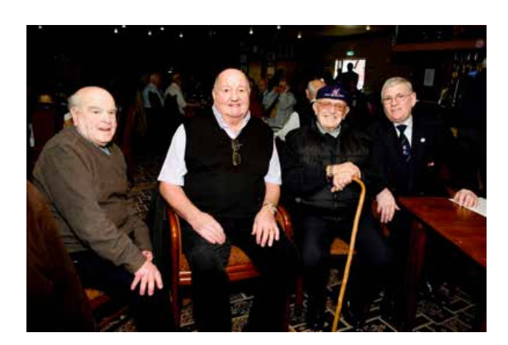
Liverpool Retired Seafarers Club members